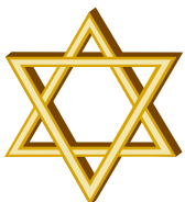
Star of David Symbol of Judaism