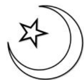
Crescent and Star Symbol of Islam